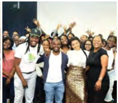
First-year students being introduced to the Financial Aid Programme.