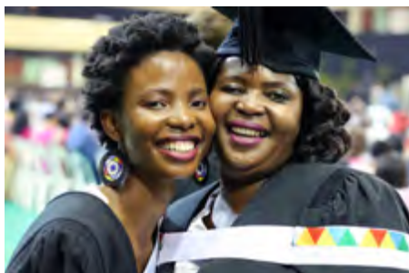
Mother and daughter celebrating graduation together.

The curriculum for the Honours degree shall include a prescribed research project as one of the modules that shall account for a minimum of 25% of the credits for the degree.