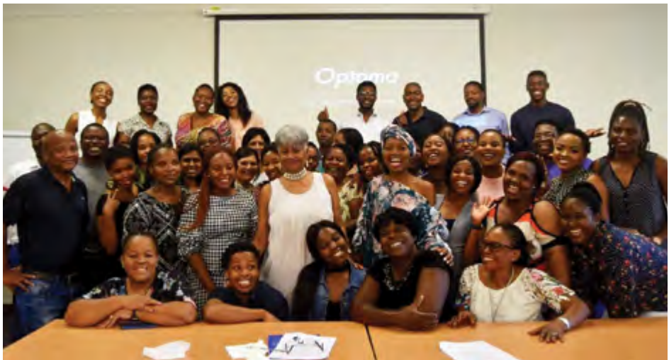
Induction Day for Research Masters and PhD programme students.

Candidates shall be required to pursue an appropriate programme of research on a subject falling within the scope of the studies presented at the University. Students must also adhere to other possible conditions prescribed by Colleges/Schools.