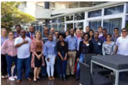
Smart Cities and Aerotropolis Masterclass.