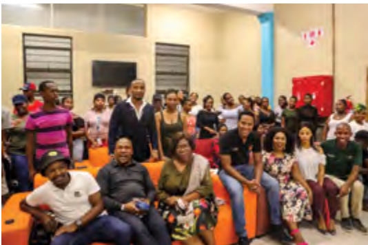
Student and residence life experience at Pixelywood.