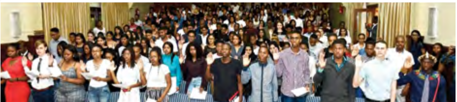
Law Pledge Ceremony 2019.