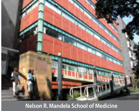
Nelson R. Mandela School of Medicine