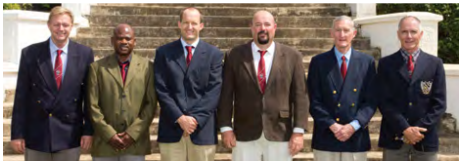
Alumnus flying the Agriculture flag high at the Agricultural Writers South Africa Awards.

The Master of Science by Coursework in Data Science will be offered in 2021 subject to approval of the relevant regulations.