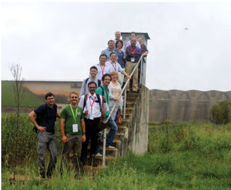
School of Life Sciences hosting the BRICS Collaborative Project Workshop.